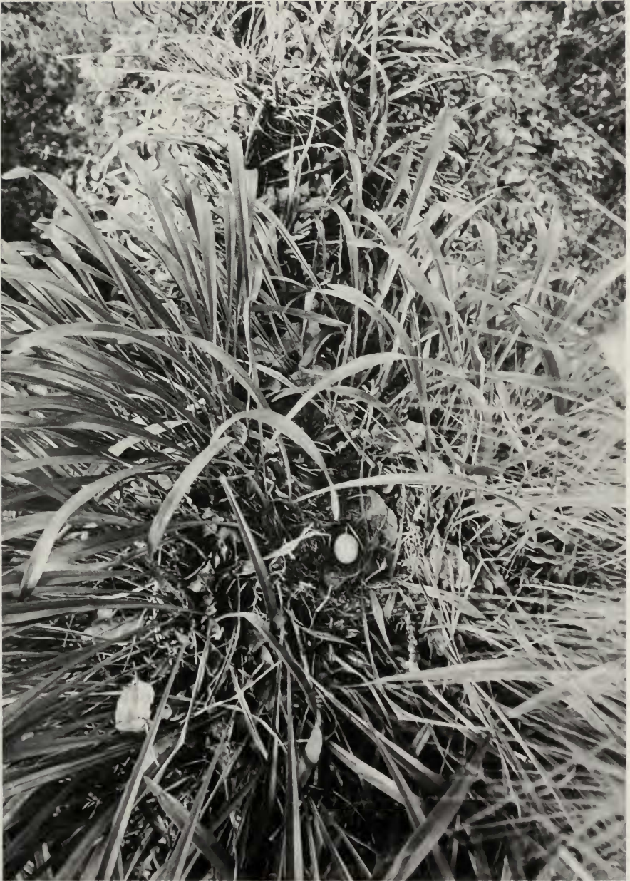
FIG. 1. Black-and-white Owl egg in nest in the orchid Trigonidium egertonianum .